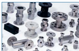
Measuring cells for any application